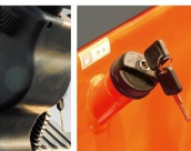
燃油箱盖带锁 Locked fuel tank cover