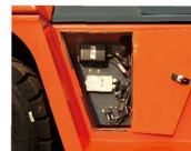
独立集成电控箱 Independent integrated electric cabinet