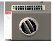
内置式暖风机(选配) Built-in heater (optional)