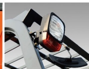
标配LED信号灯 LED signal (standard configuration)