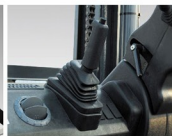
棘齿式驻车制动器 Ratchet type parking brake